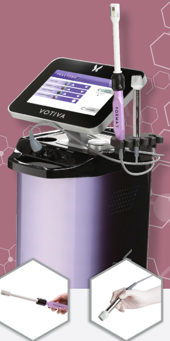
FORMA V FRACTORA V